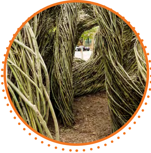
A Bird in the Hand Ash, hickory, red maple, oak and willow saplings 2015-2017 Reston Town Square Park, Reston, VA